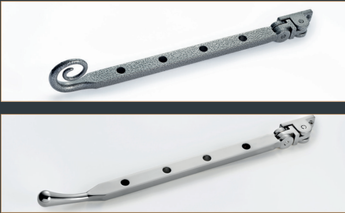
Monkey tail & pear drop 10" stays