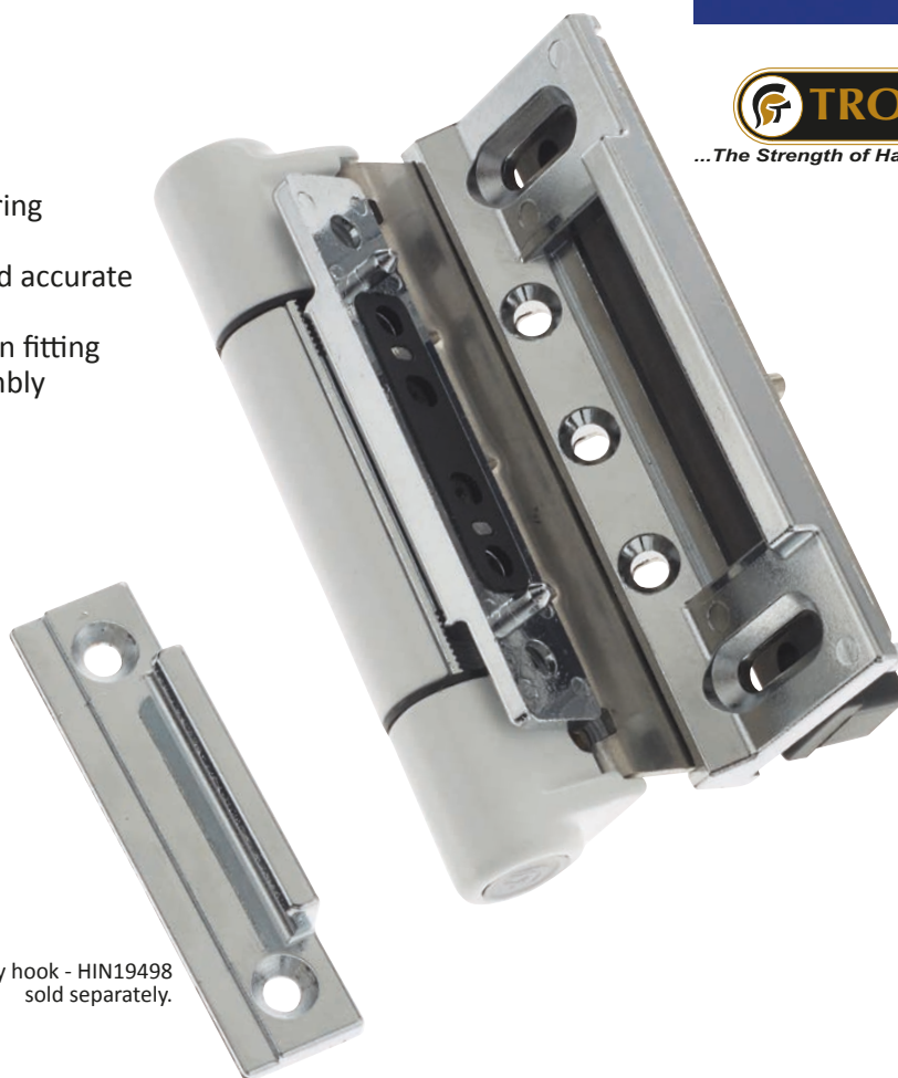
Security hook - HIN19498 sold separately.