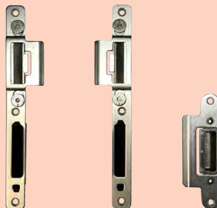
Latch Keep Non-Handed YAE90002