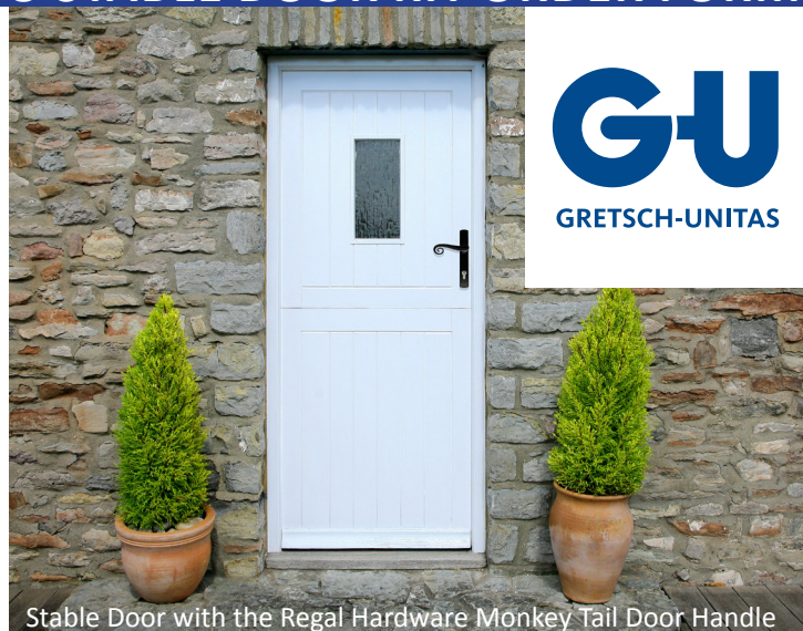
Stable Door with the Regal Hardware Monkey Tail Door Handle

Account No. _____ Company Name _____ Contact Tel.: _____ Contact Name: _____ Contact Email: _____ Your Reference: _____ Date: _____